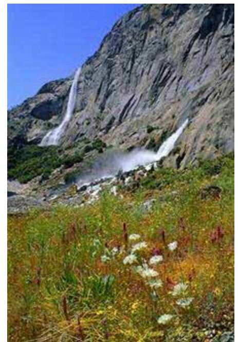
Wildflowers and Waterfalls

The Evergreen Lodge is cooperating with us by hosting evening interpretive presentations. And, they're holding some cabins for outings participants through mid-March. Please visit their website www.evergreenlodge.com/ to make reservations. Other guest accommodations near Hetch Hetchy are listed on the Y-explore Yosemite Adventures website.