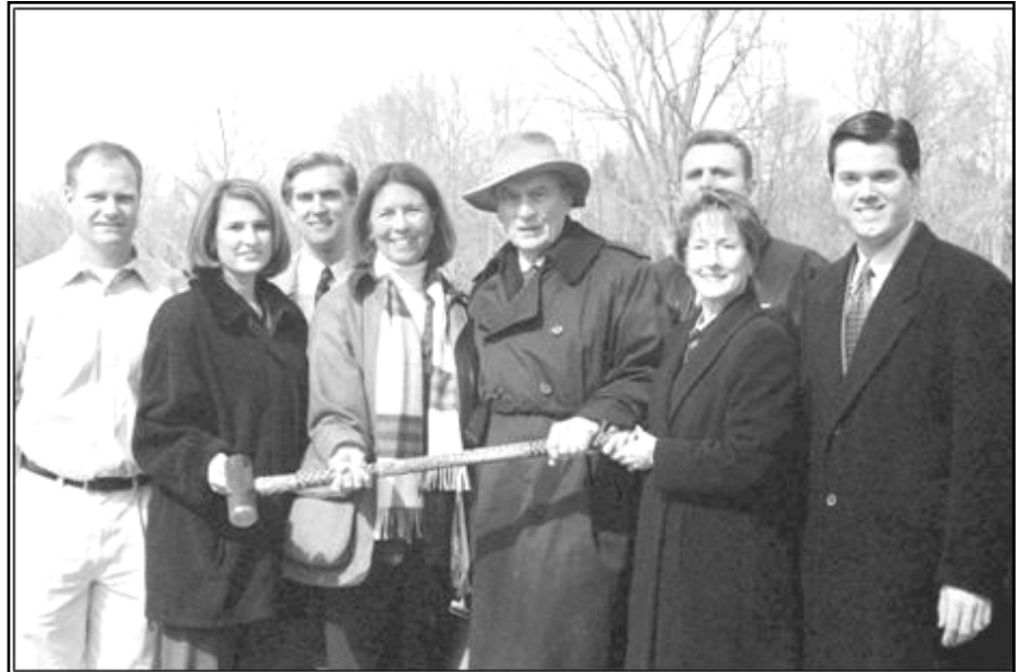
U.S. Senator John Warner (R-VA) (with hat) holds a sledge hammer at the ceremony for the Embrey Dam removal on the Rappahonock River May 2004.

Send your e-mail address to: info@hetchhetchy.org . You can read our newsletters on-line. If you would prefer not to receive a "hard copy" please send an e-mail to: info@hetchhetchy.org