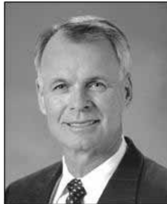
Resources Secretary Mike Chrisman

Continued from page 1 and balanced study. I encourage everyone to come to the table in good faith to assist the state in preparing a thorough analysis of all the options."