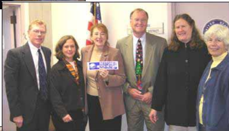
Congressman Sam Farr (D-Monterey) meets with representatives of Restore Hetch Hetchy.