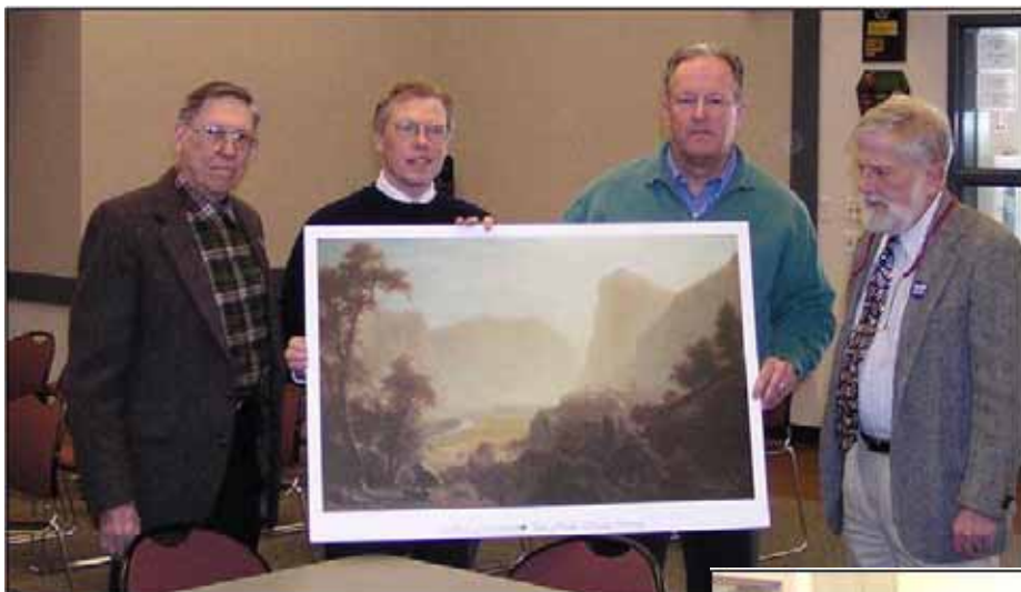
Congressman George Radanovich (R-Mariposa) receives an Albert Bierstadt poster of Hetch Hetchy Valley from constituent representatives of Restore Hetch Hetchy.

children. Finally, we would be stepping forward to provide for their long-neglected water and electricity needs while restoring a glorious natural treasure for them to enjoy forever. Any takers? 🌊