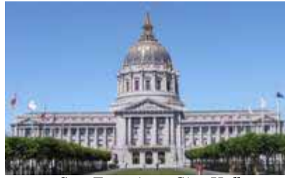
San Francisco City Hall

"San Francisco and the 28 Bay Area communities who purchase water from San Francisco play an important role in California's environment. The Hetch Hetchy system directly impacts the health of the entire Tuolumne River Watershed, as well as the San Francisco Bay/Sacramento-San Joaquin Delta ecosystem . . . These watersheds contain numerous rare plant species and provide vital habitat for aquatic and terrestrial species including steelhead trout,