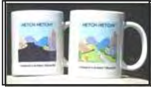
One Magic Cup