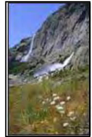
Hetch Hetchy Waterfalls & Wildflowers

The expiration date of your membership is located near your name and address at the bottom of this page. Use the form on page 7 to renew.