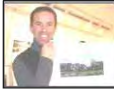
100% Organic Cotton t-shirt