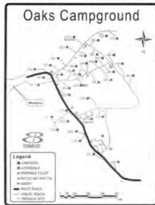
( https://rockymountainrec.com/wp-content/uploads/2021/06/Oak-1-1.pdf )

Two separate campgrounds, Oaks and Lake View, allow a camper a large number of sites to choose from, all with a picnic table and fire ring. Ample shade from the oak trees spread through the campgrounds make for plenty of cool sites. Restrooms and shared water spigots available all throughout camping areas and flush toilets, showers and laundry facilities are available closer to the marina of the park.