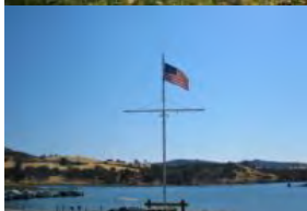
( https://rockymountainrec.com/wp-content/sabai/File/files/L_7023a7a6c8cef2244eff3c9e5e537176.jpg )