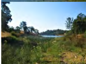
( https://rockymountainrec.com/wp-content/sabai/File/files/L_15c1ad7d1d457b3c472b6162b971a661.jpg )