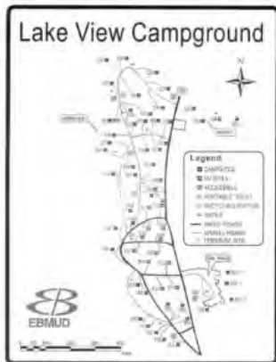
( https://rockymountainrec.com/wp-content/uploads/2021/06/Lake-View-Map-1.pdf )