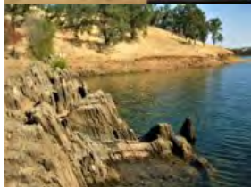
( https://rockymountainrec.com/wp-content/sabai/File/files/L_417ed1ec27dc6c1e73884f4a392f57d1.jpg )