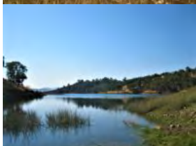
( https://rockymountainrec.com/wp-content/sabai/File/files/L_ddcb5cb8c0516492bfc8023a599c0da8.jpg )