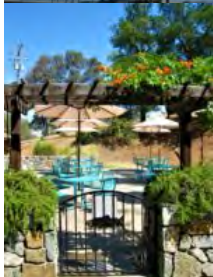
( https://rockymountainrec.com/wp-content/sabai/File/files/L_b0fc98f4c8cb4382fe1a4fafc376aa94.jpg )

Northern California ( https://rockymountainrec.com/lake-facilities/categories/northern-california )