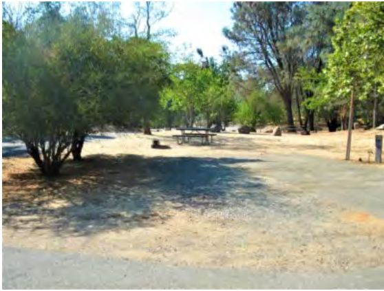
( https://rockymountainrec.com/wp-content/sabai/File/files/L_38fd55625a2bbc3ca368cb30a77536ce.jpg ) RV Site 101.JPG