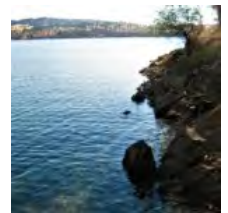
( https://rockymountainrec.com/wp-content/uploads/2017/10/Fishing-Cove-2.jpg )

California State fishing licenses are required for anyone over the age of 16. For youths under 16, the adult accompanying them is required to have a fishing license. Fishing licenses are available for sale at the lake's marina.