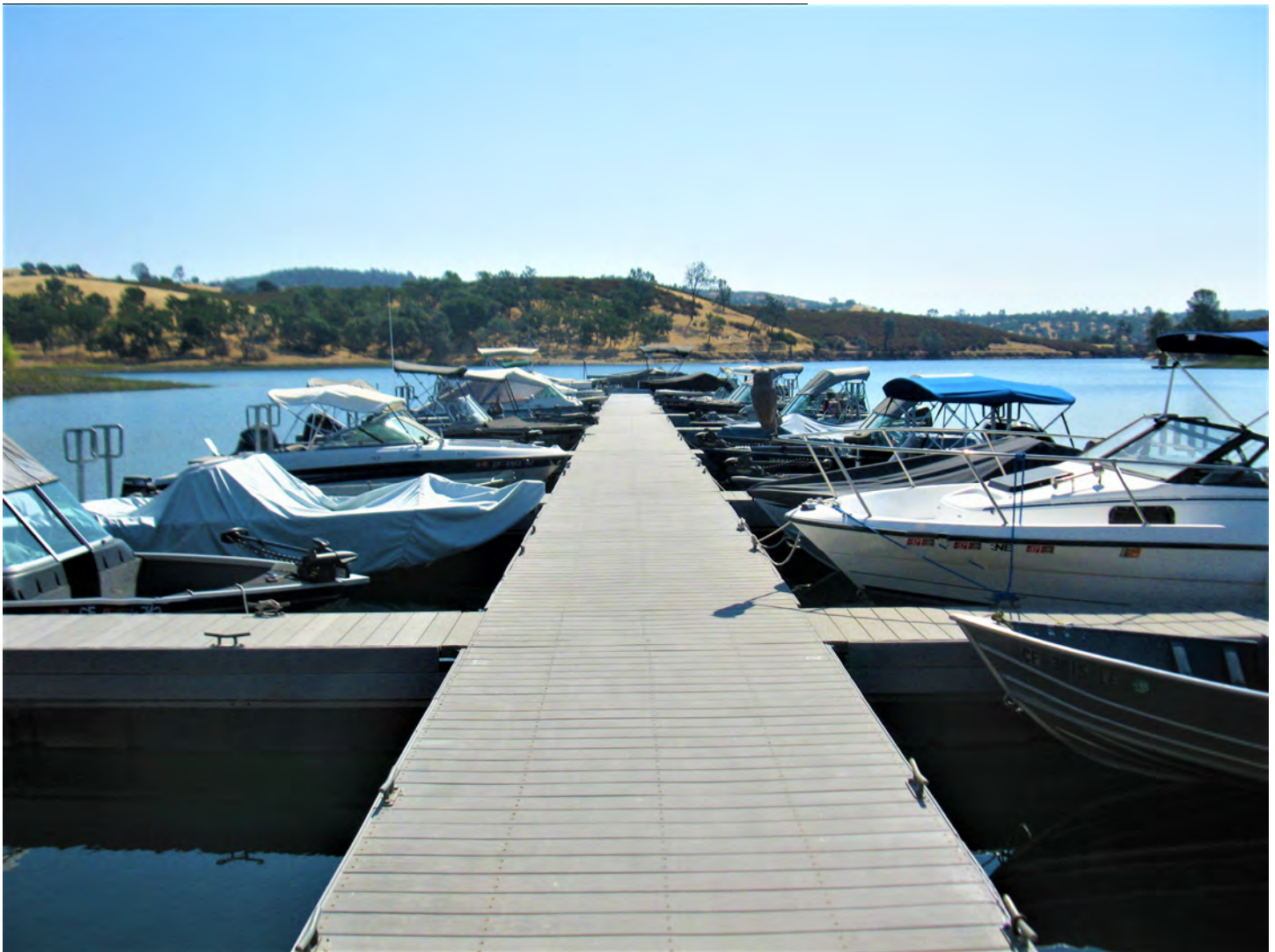
( https://rockymountainrec.com/wp-content/uploads/2017/10/Slip-Storage.jpg )

Dry Storage 12 months consecutively: $670.00