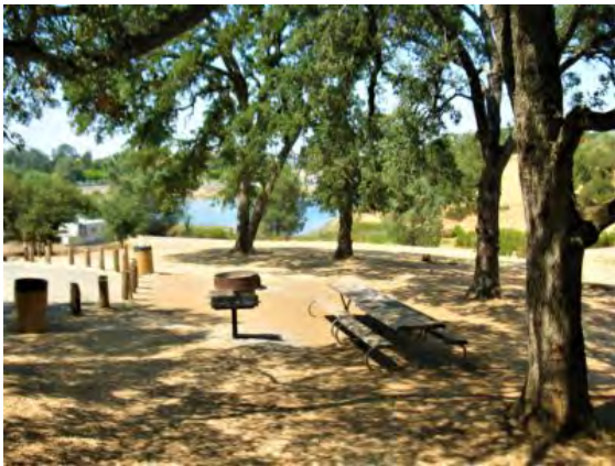
( https://rockymountainrec.com/wp-content/sabai/File/files/l_b0fa735b45338e6b84d2e31c7f5f8bce.jpg ) Double Camp Site 175D.JPG