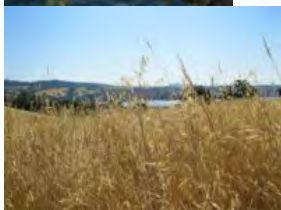
( https://rockymountainrec.com/wp-content/sabai/File/files/L_7aa9a218e12b744d4edd54b563beddd6.jpg )