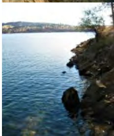
( https://rockymountainrec.com/wp-content/sabai/File/files/L_17091bcc74b3dd83e8f1593ab1ea9d66.jpg )