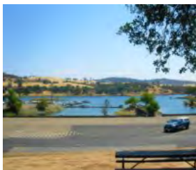
( https://rockymountainrec.com/wp-content/sabai/File/files/L_625722705d2b58170688d62c5c7f5cee.jpg )