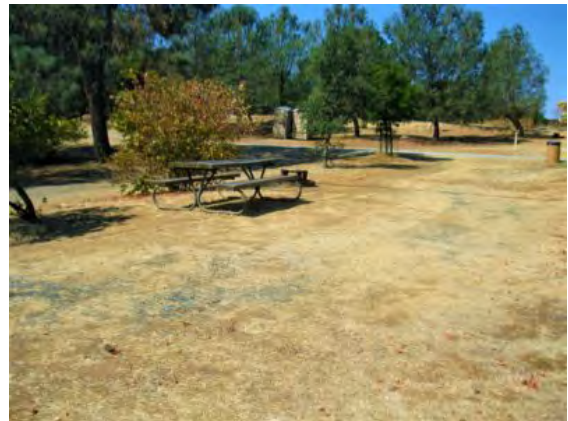
( https://rockymountainrec.com/wp-content/sabai/File/files/l_af6008439e637921cf271e41795a096e.jpg ) Camp Site 114.JPG