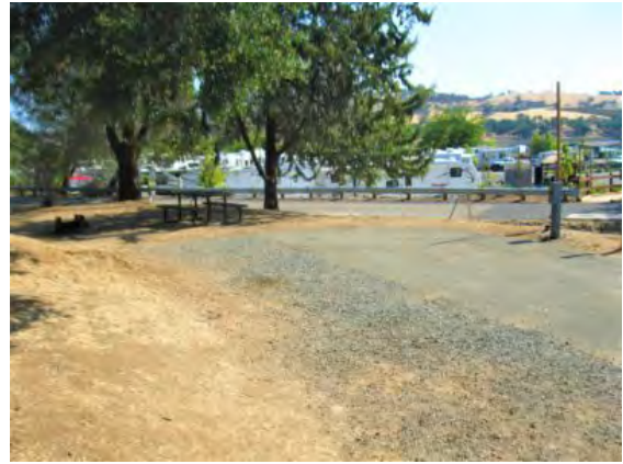
( https://rockymountainrec.com/wp-content/sabai/File/files/L_82f4831579bb2b1093324b6d39be164d.jpg ) RV Site 102.JPG