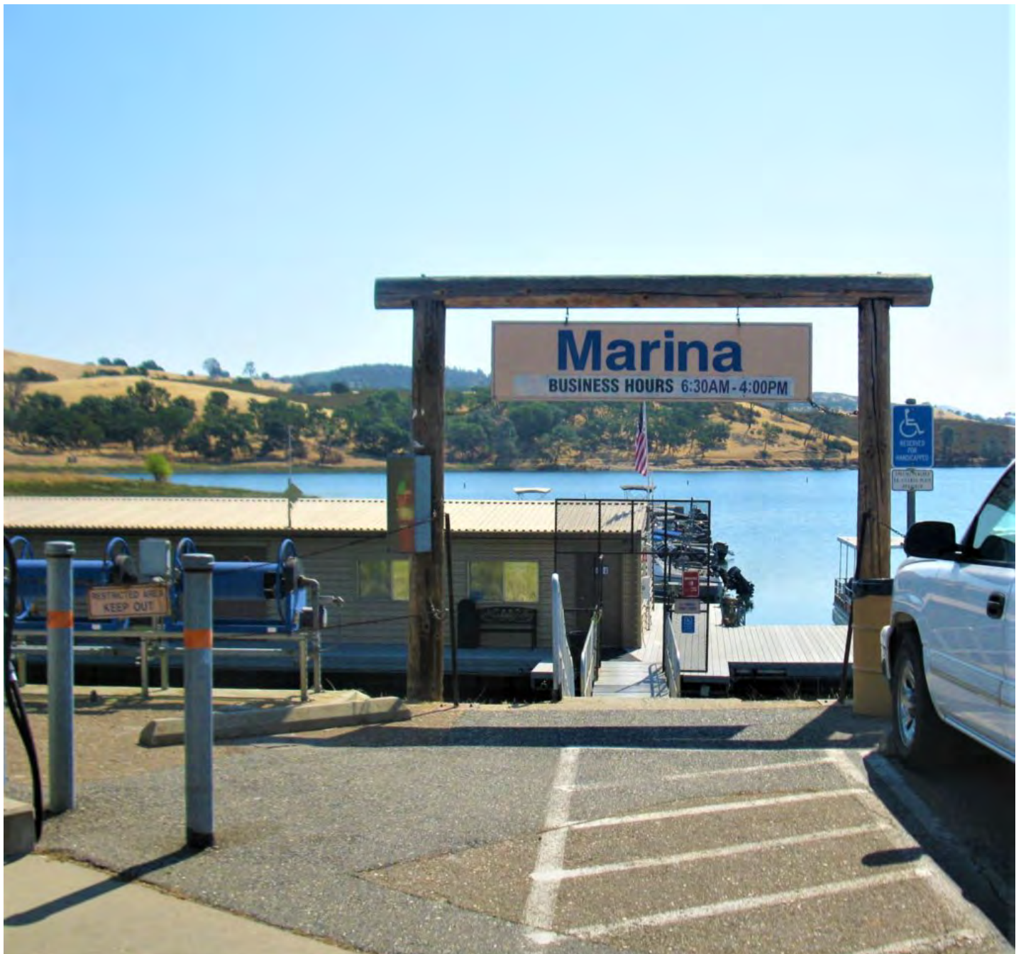
( https://rockymountainrec.com/wp-content/uploads/2017/10/Marina.jpg )

Marina Hours are 7:00 a.m.-5:00 p.m. Until Memorial Day weekend. 6:00am – 7:00pm Memorial Day Weekend to Labor Day.