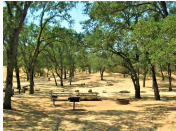
( https://rockymountainrec.com/wp-content/sabai/File/files/l_38c659e8db8637203cab72e3306d0a6e.jpg ) Double Camp Site 206D.JPG