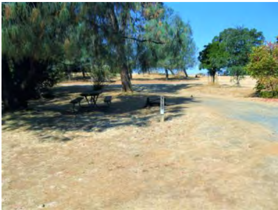
( https://rockymountainrec.com/wp-content/sabai/File/files/l_d45e47f777bdf3d915e25f7425de7da5.jpg ) Camp Site 113.JPG